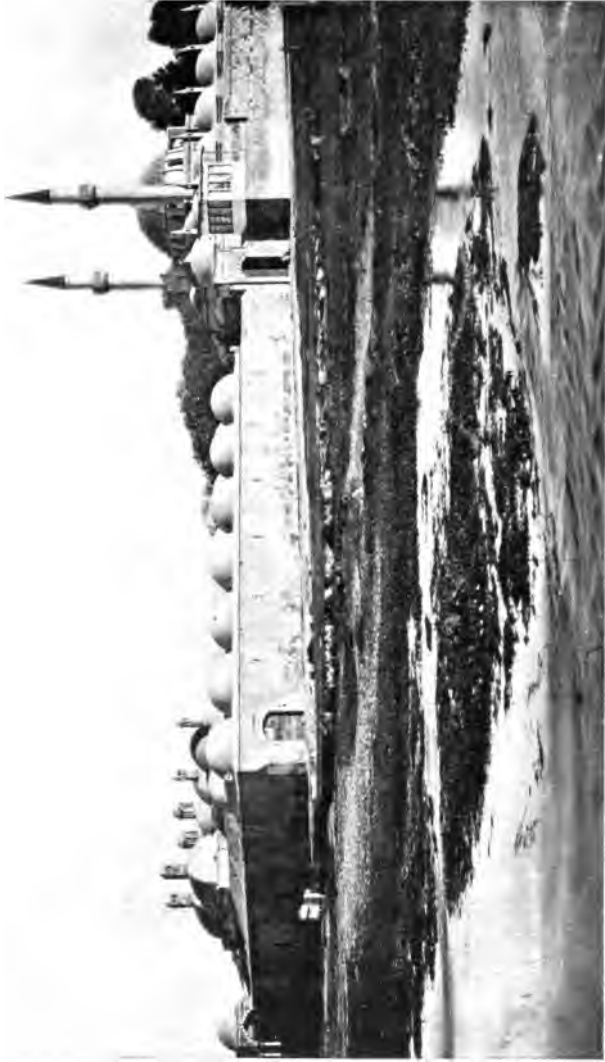
A DAMASCUS DERVISHRY